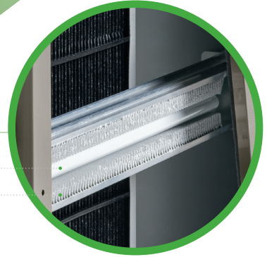
UVA Lamp PCO Cartridge